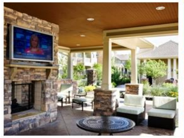
Outdoor Common Area