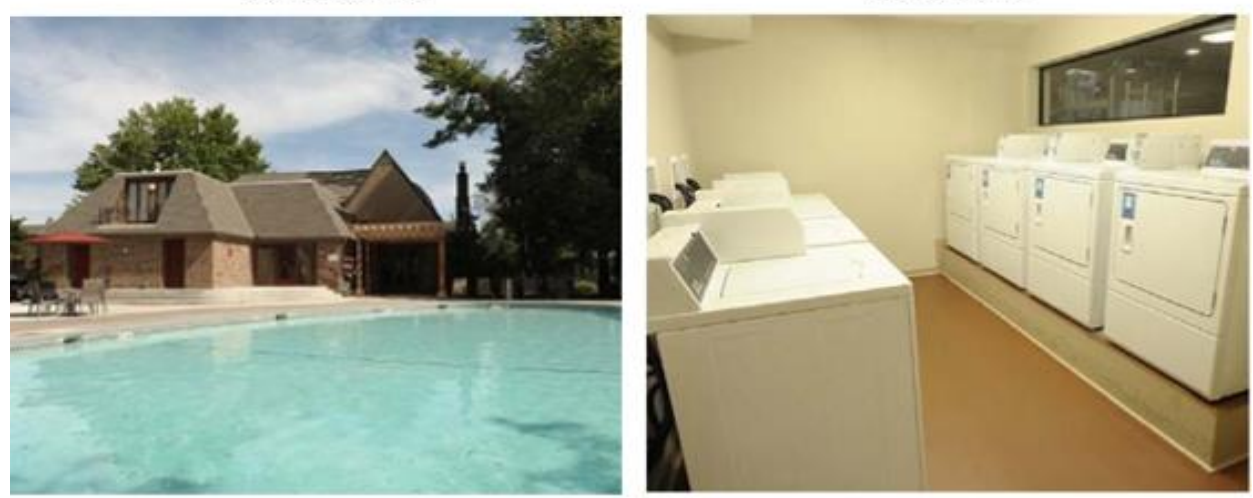
Pool Area